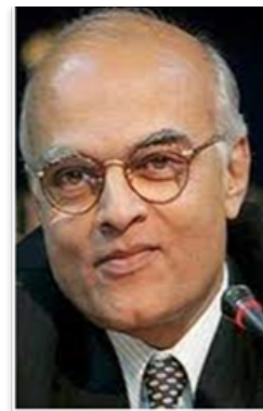
Shivshankar Menon Former National Security Advisor and Former Foreign Secretary India